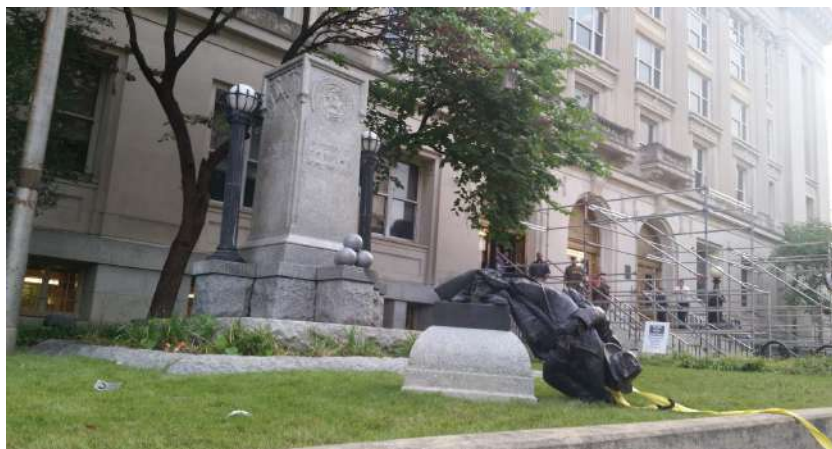
Above: August 2017 • Toppling of Confederate Statue in Durham.