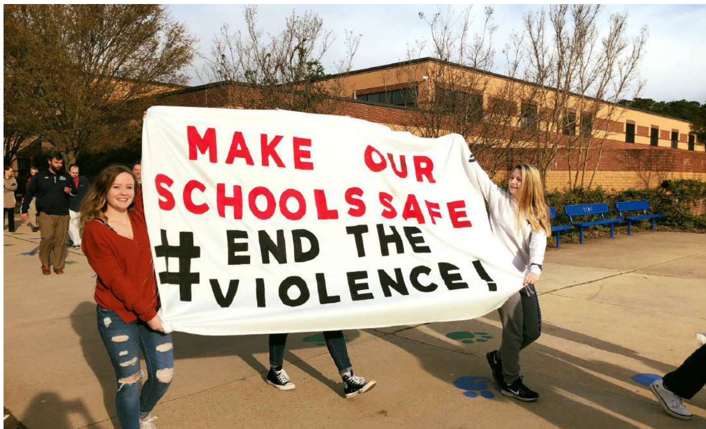
March 2018 • Raleigh • Students at Leesville Highschool walk-out protesting gun violence in schools