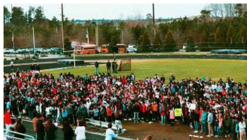
March for Our Lives walkouts on March 14, 2018