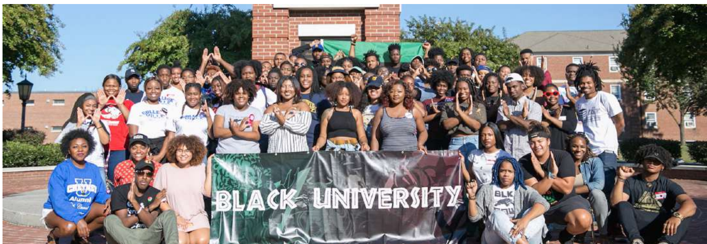
October 2017 • Winston Salem State University • Black University Summit