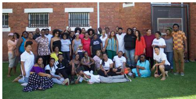
U.S. and South African Organizer Exchange convened by the Movement for Black Lives

For Ignite NC, we wanted to share stories of student organizing, especially with the #FeesMustFall campaign that won, as well as drawing connections between the tearing down of Confederate monuments in the U.S. and the tearing down of the Rhodes Statue that was in front of the school.