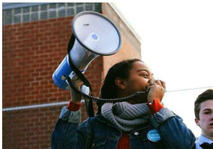
March 2018 • Students walk out in Raleigh during national protest against gun violence in schools

The six-month NC HEAT fellowship, with a cohort of 5 fellows, all young Black and queer students, started in January 2018 and ran until June 2018. The fellowship is a series of political education sessions on topics such as Media and Commu-