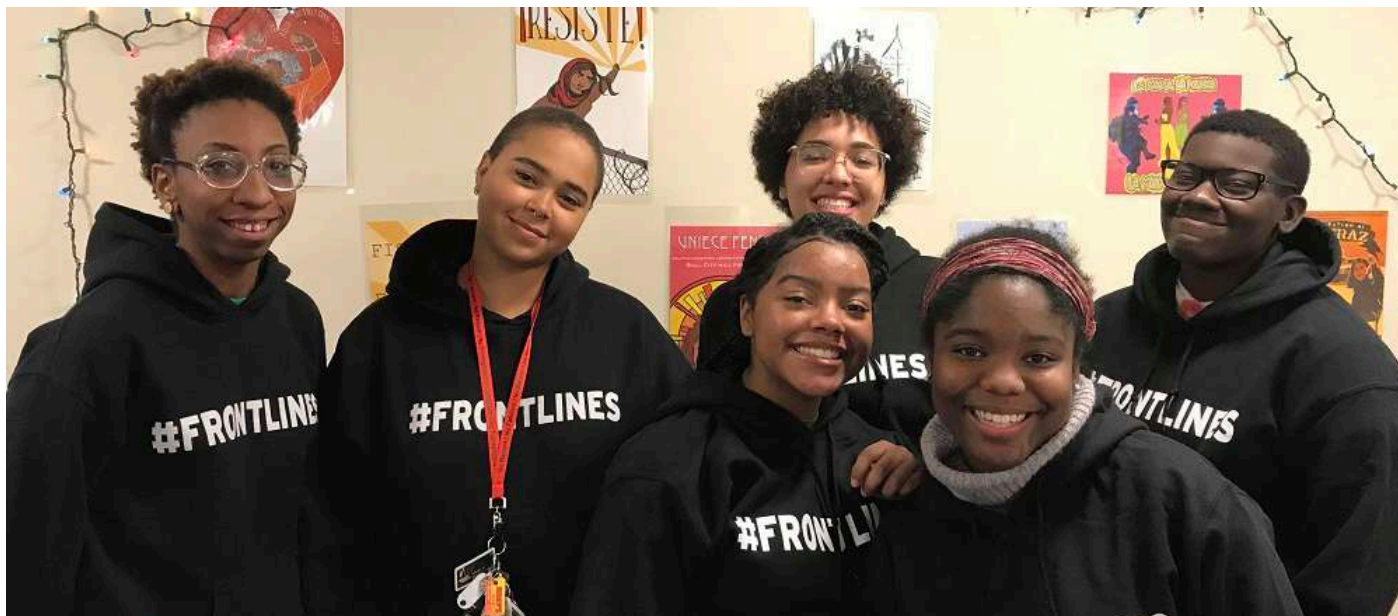
December 2017 • The first cohort of NC HEAT (Heros Emerging Among Teens) Fellows started in December 2017. NC HEAT grew out of YOI's Freedom School with the goal of providing political education to youth leaders.