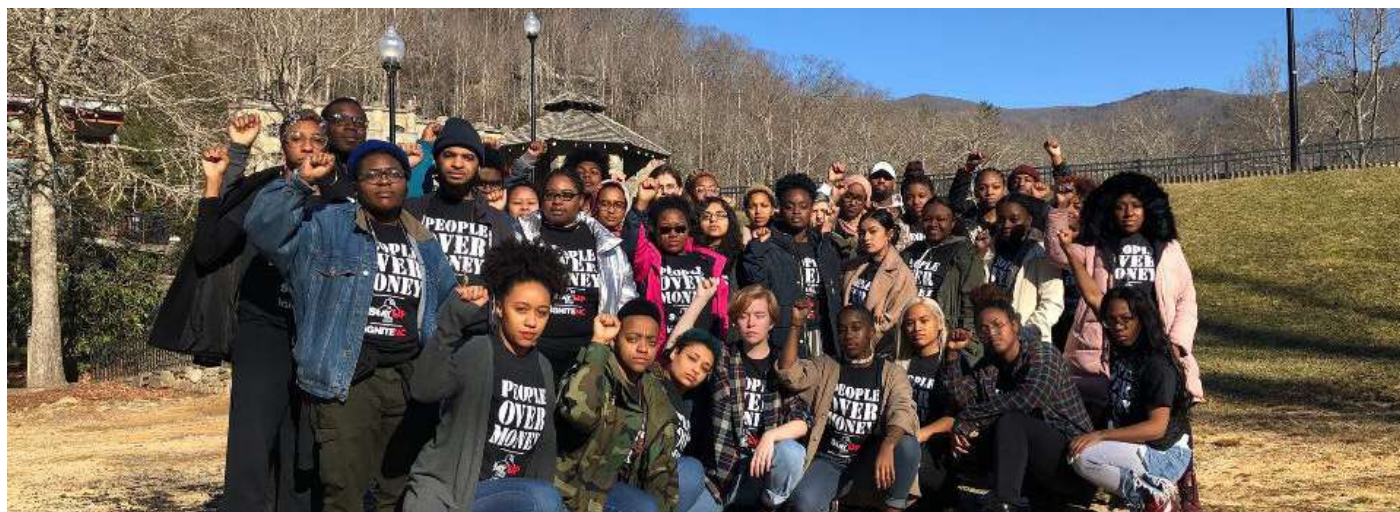
September 2017 • Ignite NC's Fall 2017 cohort of fellows at a three-day training retreat.

Ignite NC Fellows at UNC-Charlotte won their campaign to get an LGBTQ Center. Fellows at NC A&T, while working to get their own LGBTQ Center, held a powerful Pride Week and started a community needs assessment on campus so people can define what they need and what safety means to them. Ignite NC fellows worked to challenge white supremacy on their campuses—from Appalachian State students proactively countering white supremacists organizing on their campus, pushing the administration to actually respond and engage, to students at UNC-Chapel Hill working to take down the Silent Sam monument.